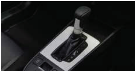
7-Speed CVT Transmission