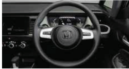
Elegant Steering Wheel