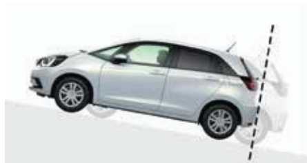
Hill Start Assist