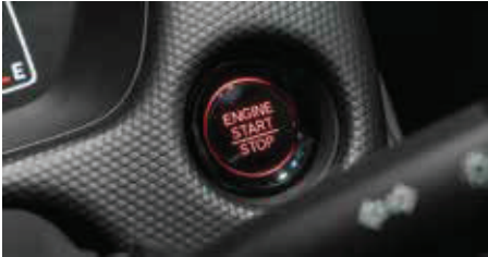
Smart Key System