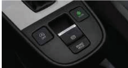
Electric Parking Brake