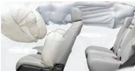
i-SRS Airbag System