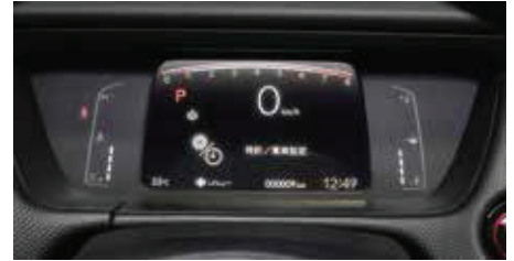
Digital Multi-Information Display