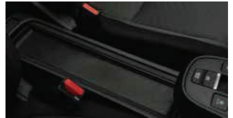
Rubber Non-Slip Console