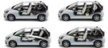
Multiple Seating Configurations